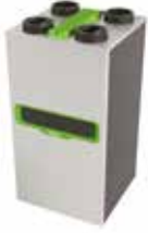
InspirAIR Top 450 Classic

The heat recovery ventilation solution that efficiently filters out the smallest pollutants and adapts to your needs.