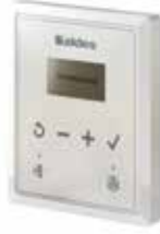
Remote control InspirAIR