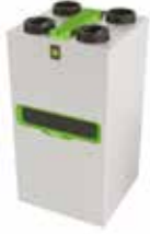
InspirAIR Top 450 Premium

The connected heat recovery ventilation solution that efficiently filters out the smallest pollutants and adapts to your needs.